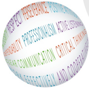
Illinois Essential Employability Skills Framework and Self-Assessment