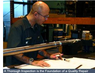
A Thorough Inspection is the Foundation of a Quality Repair

Formed in 1969 in Chicago, Hydro, Inc. is a global company and the largest independent pump rebuilder in the world. The company employs more than 170 people in Illinois and more than 430 worldwide. Hydro recently purchased a third storage facility on Chicago's south side and is among the many Illinois-based manufacturing companies that are taking advantage of the state's central location, skilled workforce and strong business climate to expand their operations and create jobs.