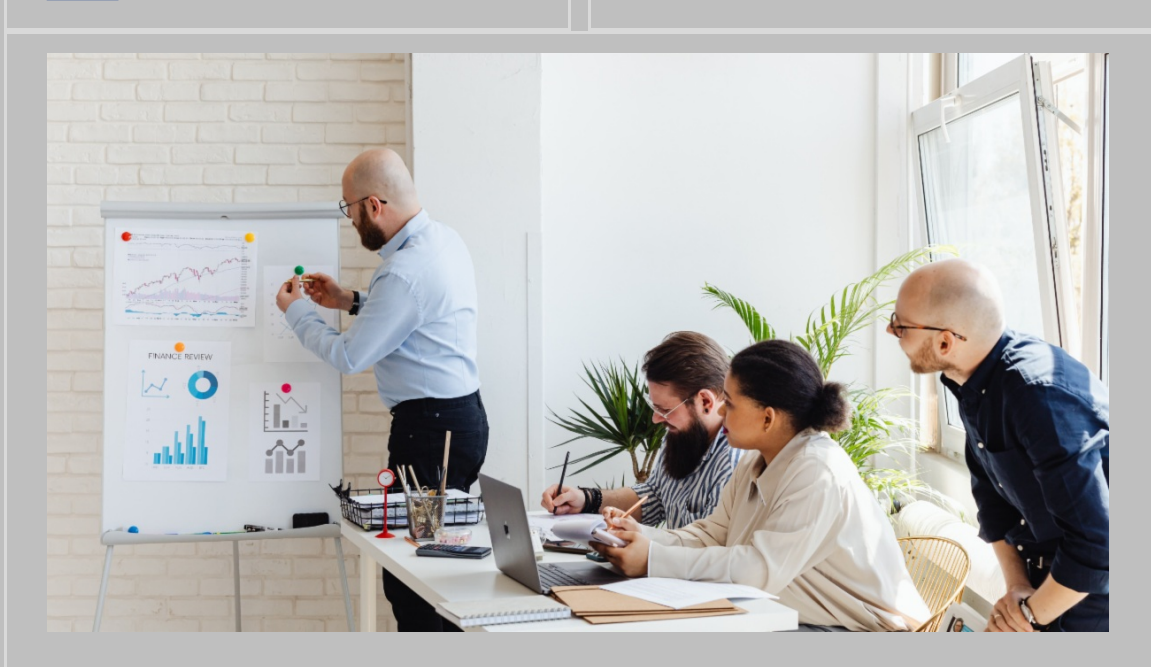
Bee2Bee Network Apprenticeships Announce $30 Million Program <u>Expansion</u>

Follow ApprentiScope for national apprenticeship news.