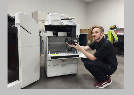
Apprenticeship Programs Grow During High US Employment Rate