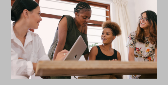
Boston Announces Expansion of Apprenticeships for BIPOC Residents