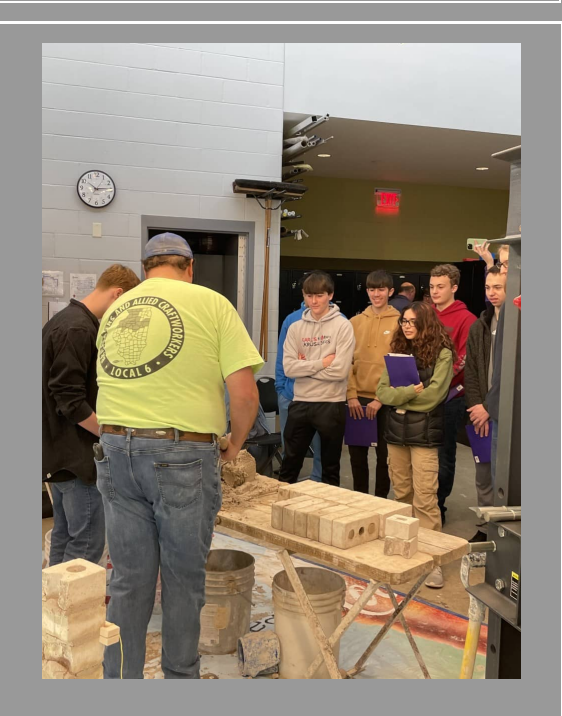
IVCC Hosts Illinois Valley Building Trades Career Fair