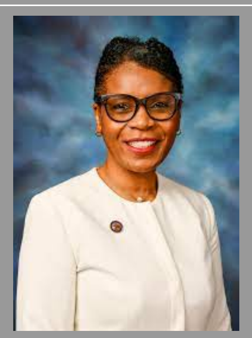
Johnson Secures Nearly $300,000 for North Chicago Pre-Apprenticeship Programs