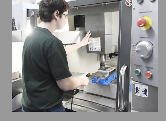
Apprenticeships A Path to Good-Paying Jobs

Workers' in the Labor Force to Meet Offshore Wind's 2030 Goals: NREL