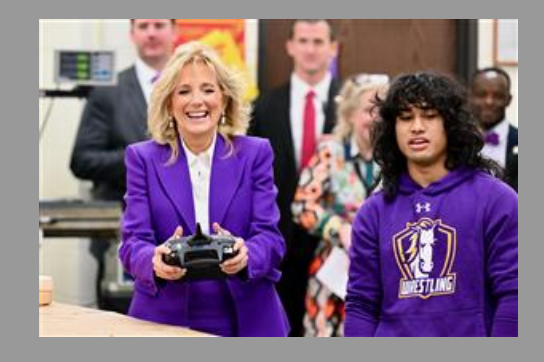
First Lady Lauds 214's Career-Connected Learning