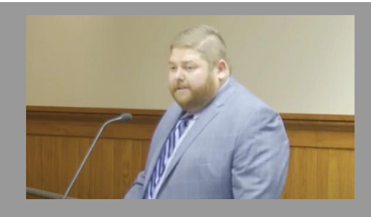
Ottawa City Council Hears of Outreach to Schools on 'What the Building Trades Have to Offer'