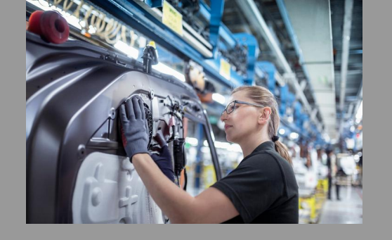
Apprenticeship Changes Lives, Especially for Women