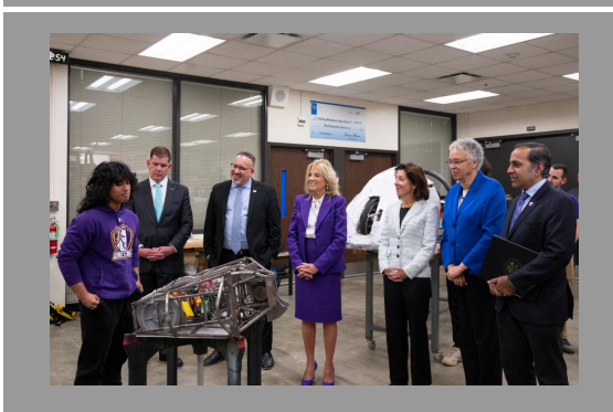
Looking Back on National Apprenticeship Week 2022