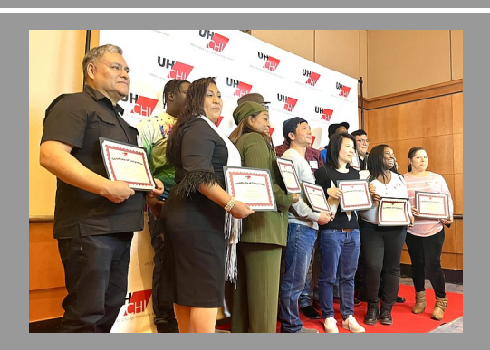
UHCHI Celebrates Graduates of the Culinary Apprenticeship Program