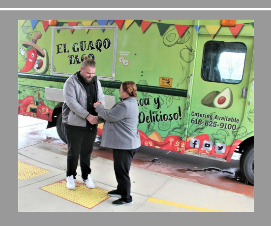
Food Truck Provided by Apprentice Program