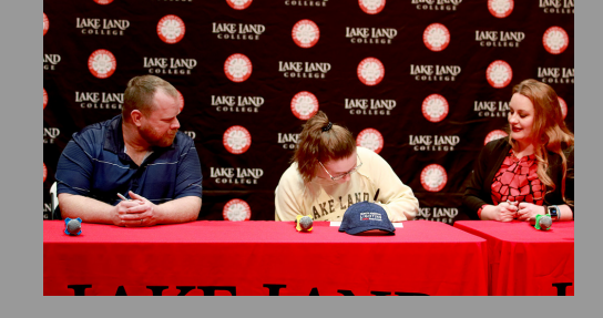
Lake Land College Partners with Local Businesses for National Apprenticeship Week