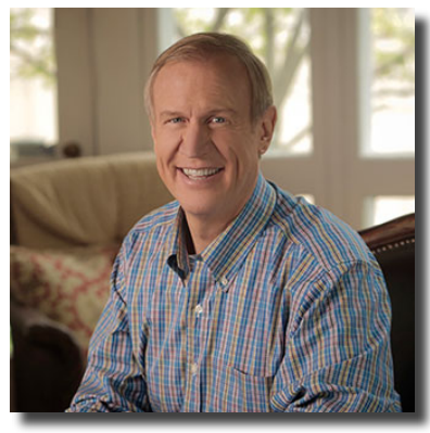
Bruce Rauner, Governor

As you read about the programs and the individual success stories that are highlighted in this report, know that we are proud of what we have accomplished as a state workforce development system, but also know that we realize we are just getting started.