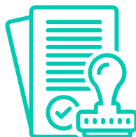
Permits & Zoning