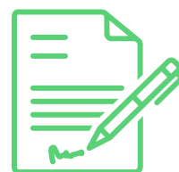
Applications & Deposits