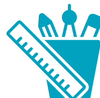
Equipment & Supplies