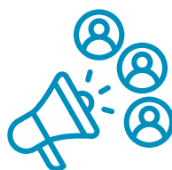
Marketing & Outreach