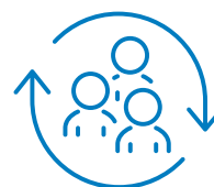
Staff & Operations