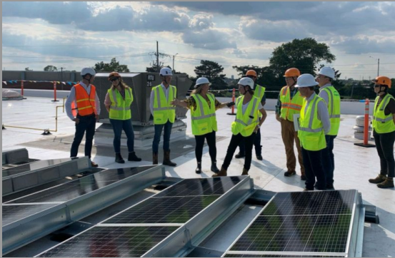
Illinois Solar Contractor Showcases Successful Apprenticeship Program