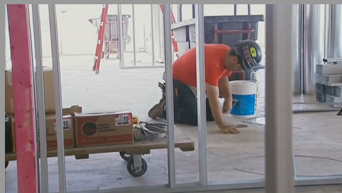
Career-Launching Apprenticeship Fair in Denver