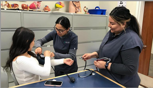
Growing and Evolving Apprenticeships