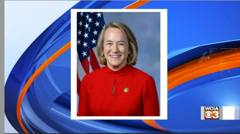
Rep. Budzinski Pushes for Apprenticeships in First Bill in Congress