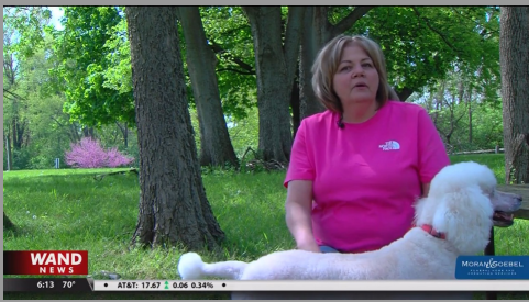
IDOC Program Prepared Local Woman for Life After Incarceration