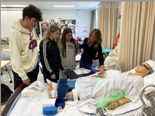
District 214 Prepares Students for Careers in Healthcare