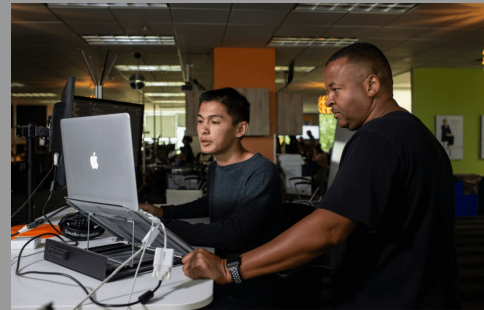
Apprenticeships on the Rise