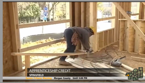
Apprenticeship Tax Credit Possible in Illinois