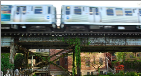
CTA Approves $3.4M in Contracts to Expand Workforce Partner Program