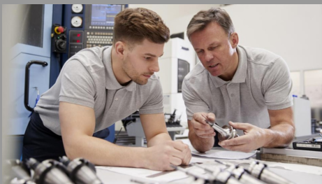
What is an Apprenticeship? Here's What You Should Know.