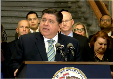
Gov. Pritzker Announces $16 Million in Funding for Climate Works Pre-Apprenticeship, Barrier Reduction Programs