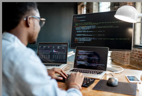
Big Employers Turn to Apprenticeships for Tech Talent

Have information to share? Email apprenticeship@illinoisworknet.com