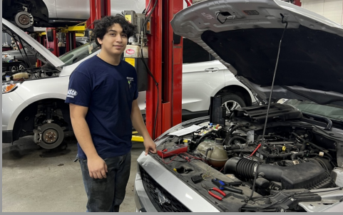
Hersey Student Hits Fastlane to Success with Apprenticeship