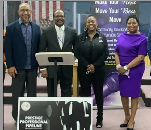
From Parents to Paras: Illinois Program Brings Professional Training to Families