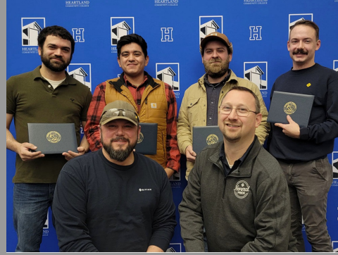
Heartland College Graduates First Cohort of Rivian Apprentices