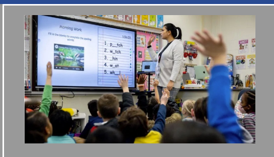
Federal Government Seeks to Boost Teacher Pipeline Through Paid Apprenticeships