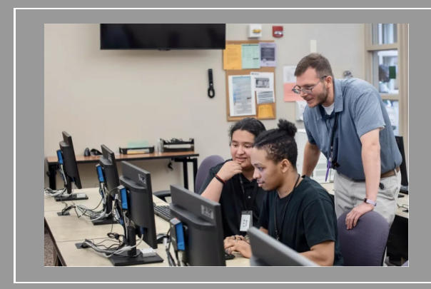
A Trade School Can Be a Better Fit Than College and Lead to a More Lucrative Career for Some Students