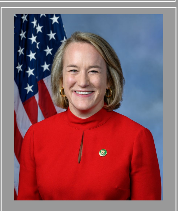
Budzinski Introduces Bipartisan Tools Tax Deduction Act