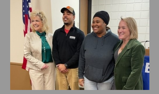
Workforce Investment Solutions Participants Inducted into Local IBEW 146

Construction Starts on the Largest Solar Project in Illinois