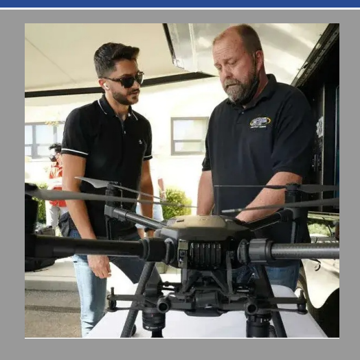
Fullerton College Introduces