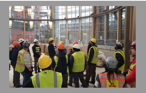
Pre-Apprenticeship Construction Training Program Still Creating Opportunities for Young People

ZOLLER Donates Nearly $250K to Washtenaw Community College for Student Training, Apprenticeship Program