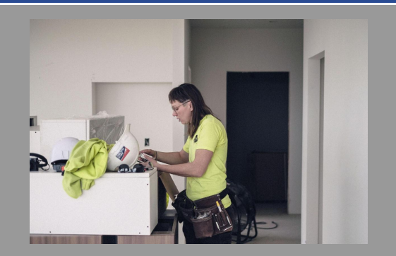
Apprentice Work a Lucrative Career Alternative to College